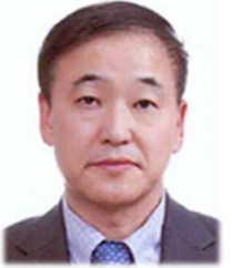
H.E. LEE Yang-goo – Ambassador of the Republic of Korea to Ukraine