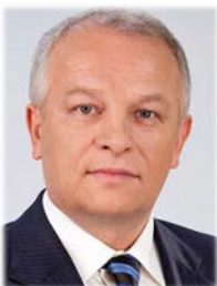
Mr. Stepan KUBIV - First Vice Prime Minister of Ukraine - Minister of Economic Development and Trade of Ukraine